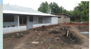
The construction of the building is coming along well.