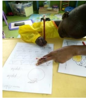
Some writing practice is taking place.