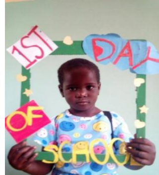
We had a fun first day of school.