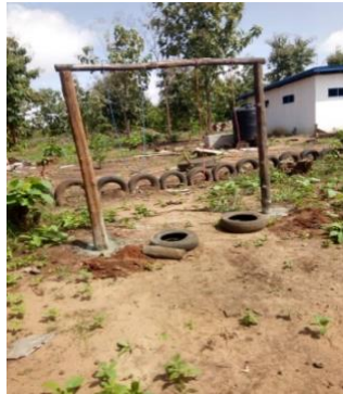
The playground is shaping up!